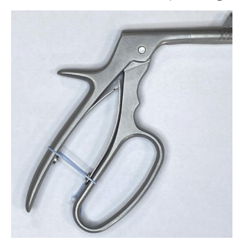
Figure 1: Bone Crusher (XNI-014) with handle locked in "open" position

The Bone Crusher should be reprocessed in the "open" position to ensure that all areas can be thoroughly cleaned prior to sterilization. To keep the device open, a breakaway tab (or similar) can be wrapped around the front & back handles as shown in Figure 1 resulting in the distal arms to remain open (Figure 2).